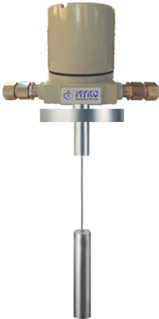
Product Code : MK-DLS 1000 -1CP