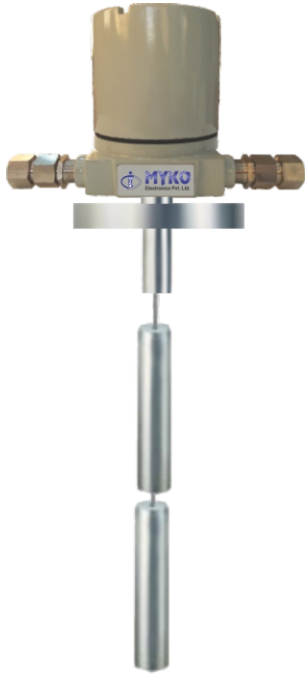
Product Code : MK-DLS 1000 Series