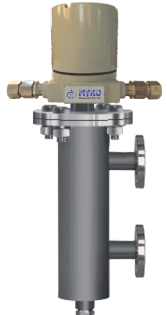
Product Code : MK-DLS 1000 -2CP-EC