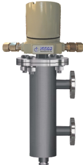
Product Code : MK-DLS 1000 -1CP-EC